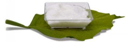
ULTIMATE NIGHT FACIAL MOISTURIZER