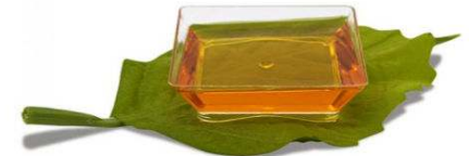
SEA BUCKTHORNE OIL