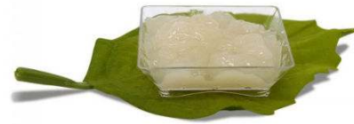
ULTIMATE EYE GEL