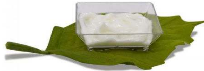
ULTIMATE EYE CREAM