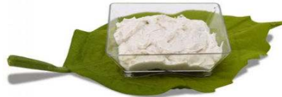
VITAMIN C EXFOLIATING MASK