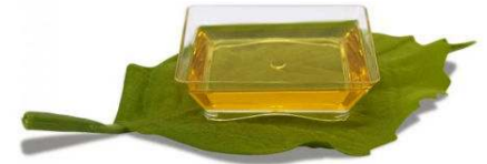
BARBARY FIG SEED OIL