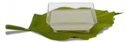
SUPREME POMEGRANATE LEMONGRASS ZEST TONER