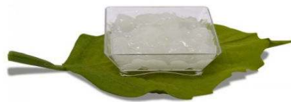
SUPREME EYE GEL