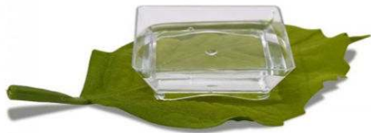
ORANGE BLOSSOM WATER skin