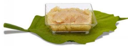
POMEGRANATE SUGAR SCRUB body