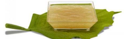
MACADAMIA SUGAR SCRUB