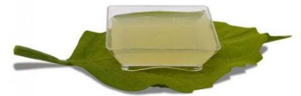
VITAMIN C SERUM W/ HYALURONIC ACID