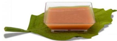
SUPREME PINK & GREEN CLAY CLEANSER