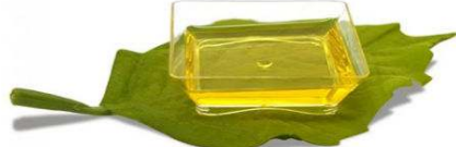
DEEP CLEANSING OIL