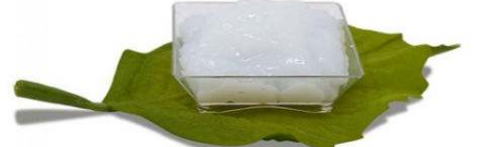
FACIAL BOMB MASK