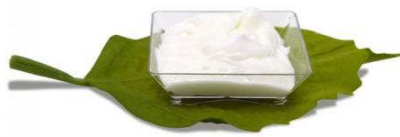
VITAMIN C SERUM