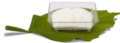
RETINOL CREAM MOISTURIZER