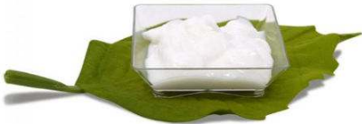
UNDER EYE TREATMENT