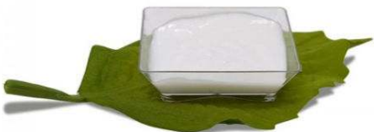
SUPREME EYE CREAM