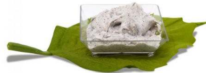
BAMBOO CRAMBERRY SCRUB