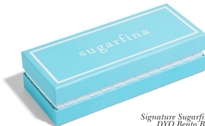
Signature Sugarfina 3pc DYO Bento Box