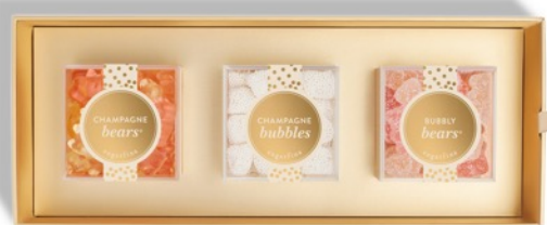
Congrats 3pc Preset Bento Box