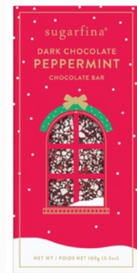
Peppermint Bark Dark Chocolate Bar