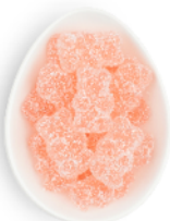
Sparkling Rosé Bears