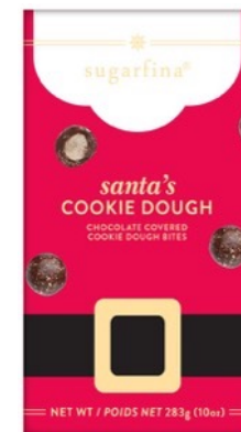
Santa's Cookie Dough Bites