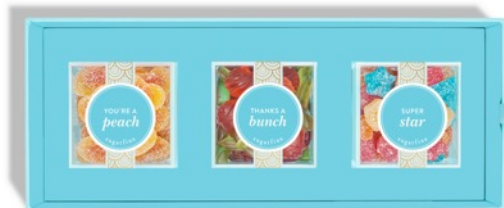
Thank You 3pc Preset Bento Box