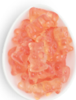
Rosé All Day (Bears)®