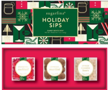
Holiday Sips 3PC Candy Bento Box®