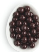
Mint Chocolate Caviar