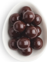
Dark Chocolate Sea Salt Caramels