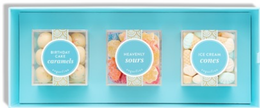
Happy Birthday 3pc Preset Bento Box