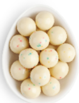
Birthday Cake Caramels