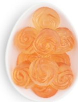
But First, Rosé (Roses)