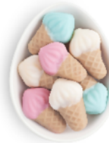
Ice Cream Cones