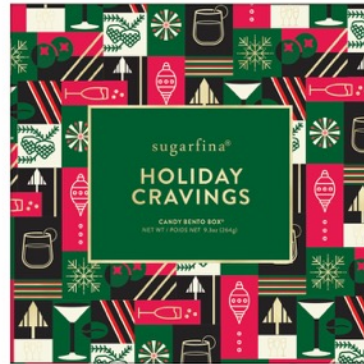
Holiday Cravings 8PC Candy Bento Box®