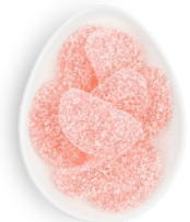
Tequila Grapefruit Sours