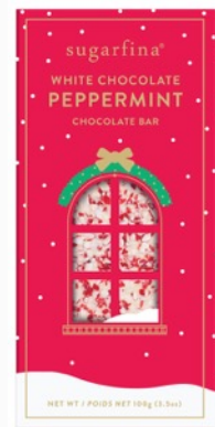
Peppermint Bark White Chocolate Bar