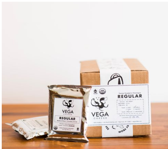
2.5 oz, Whole Bean or Ground