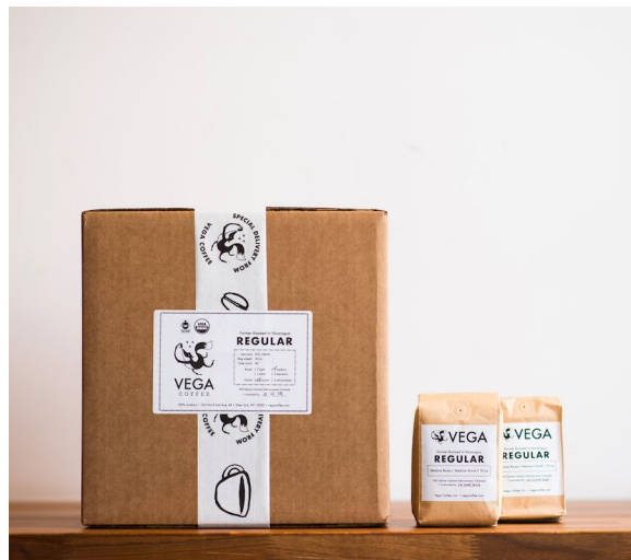
10 oz, Whole Bean or Ground