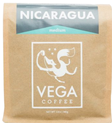
12 oz, Whole Bean or Ground