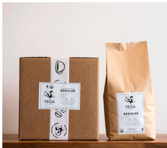
5 lb, Whole Bean